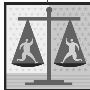
Bringing Balance to Work, Home, and Life