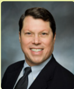
Chief Medical Officer First Choice Health